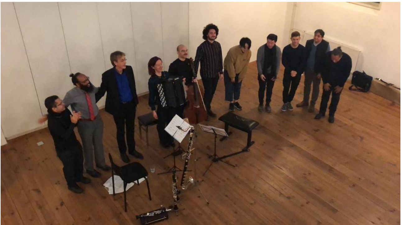
Final concert Academy 2019

Roadrunner Trio is a unique ensemble consisting of accordion, clarinet and cello, founded in 2014. The three musicians came together to create a 'pool' for experimenting with new ideas regarding repertoire, arranging, improvising and performance. Roadrunner is an environment where the musicians challenge each other, question contemporary/old customs and approach new ways to really connect with the audience. In addition to contemporary music, the trio also uses melodies and elements from traditional music - both classical and folk music.